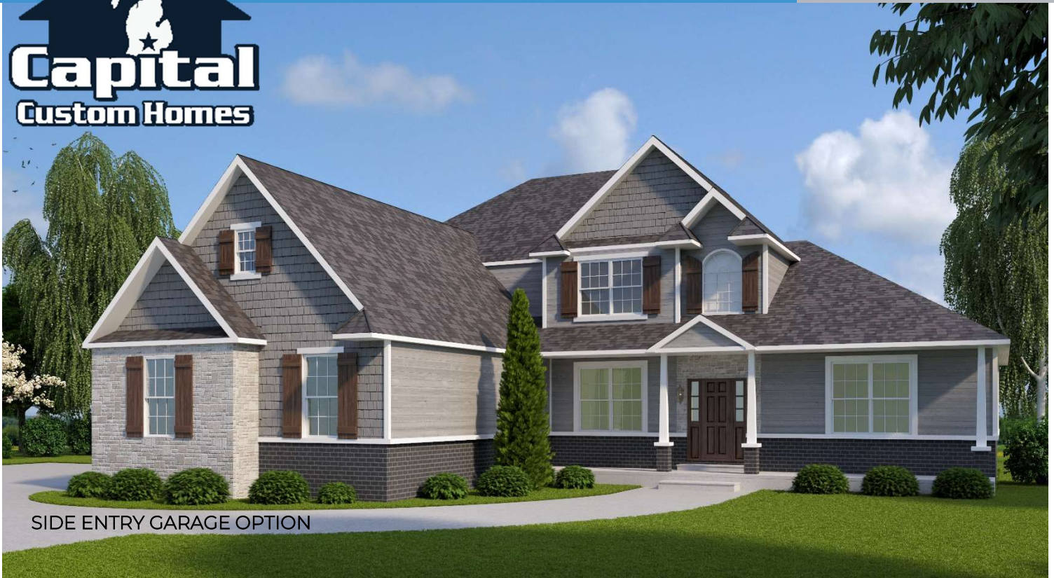
SIDE ENTRY GARAGE OPTION